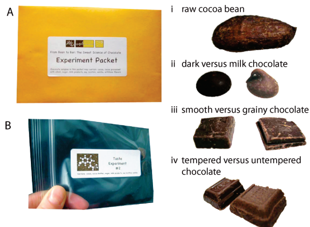
Figure 1. Tasting experiment packet and contents: (A) The envelope distributed to each audience member. (B) The envelope contains small plastic bags for each of the following taste experiments: (i) a raw cocoa bean; (ii) a piece of dark and milk chocolate; (iii) two pieces of chocolate with different texture, one smooth and the other grainy; (iv) a piece of chocolate that has been “untempered” and a tempered control sample.